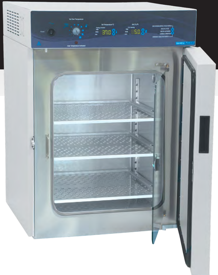
Decontamination Cycle Time